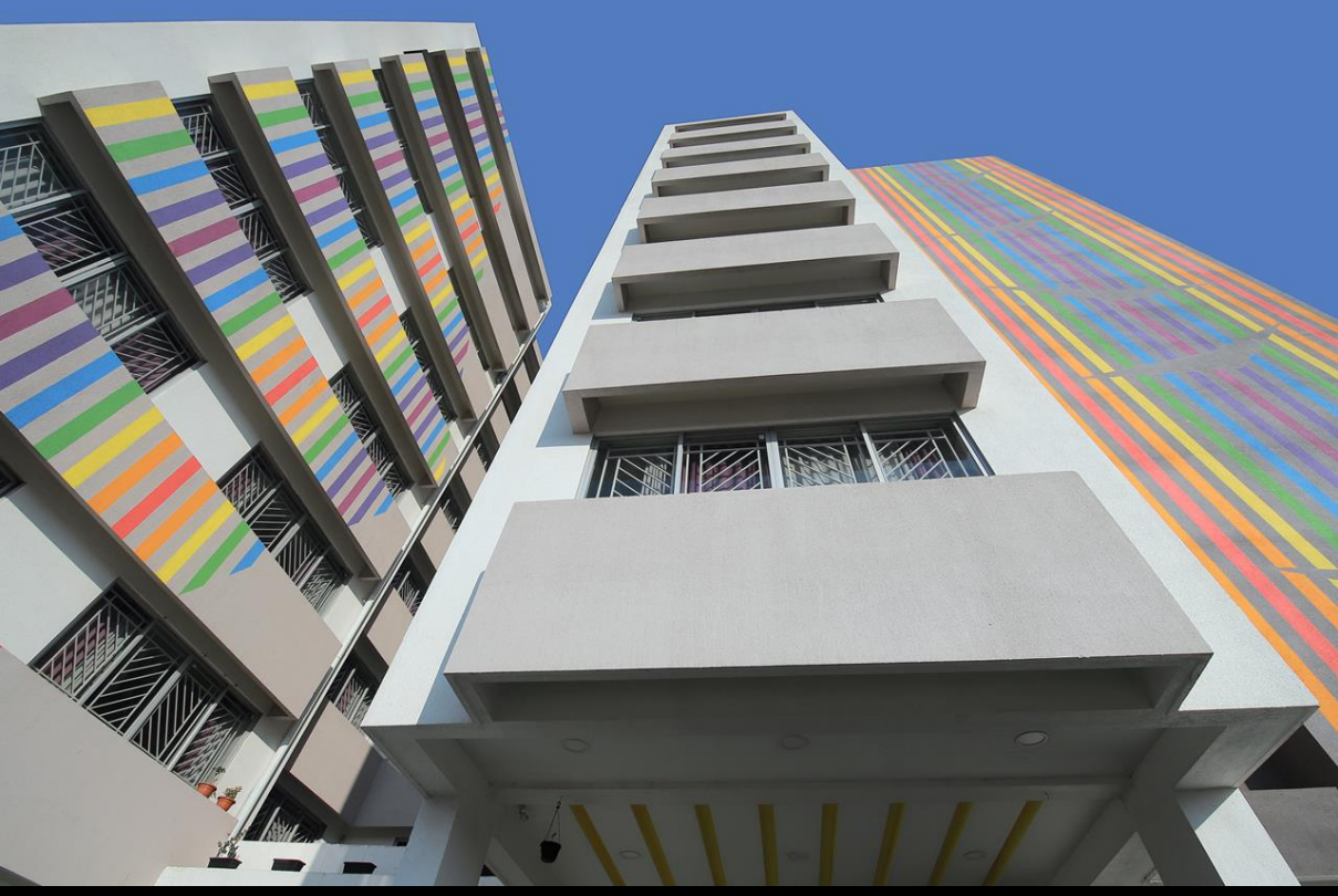
Phase 1 Completed